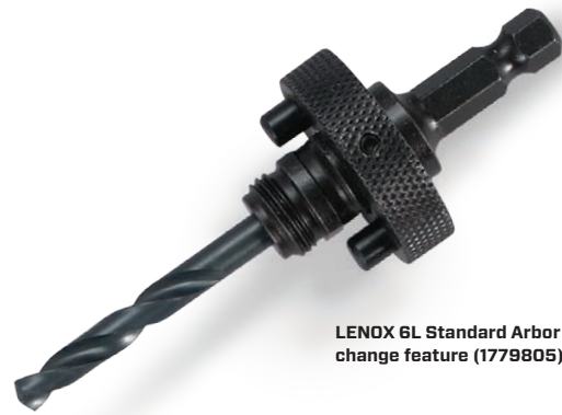
LENOX 6L Standard Arbor with quick change feature (1779805)

Split point pilot drill for faster penetration and less walking